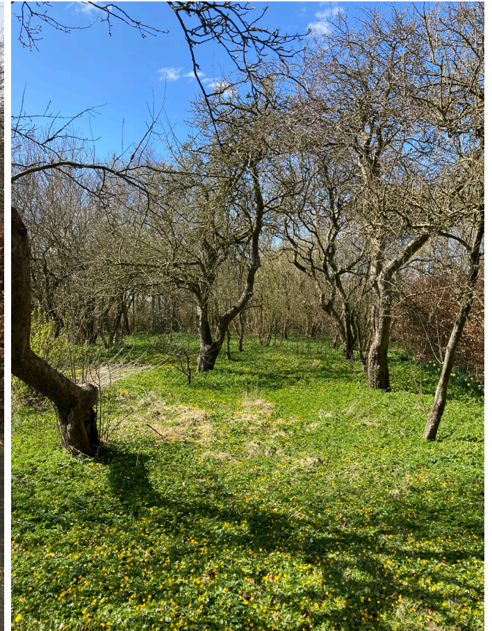
Apple tree orchard with different older varieties