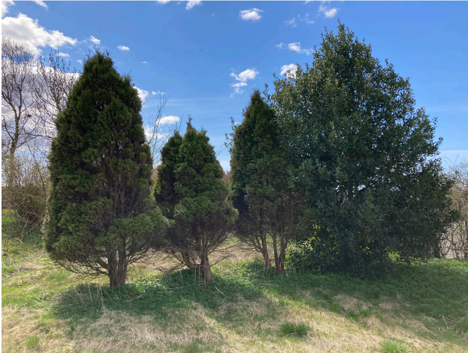
Three Thuja occidentalis and a single Ilex aquifolium