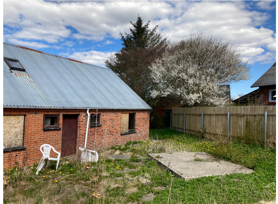
Concrete slab and steps from a former garden shed