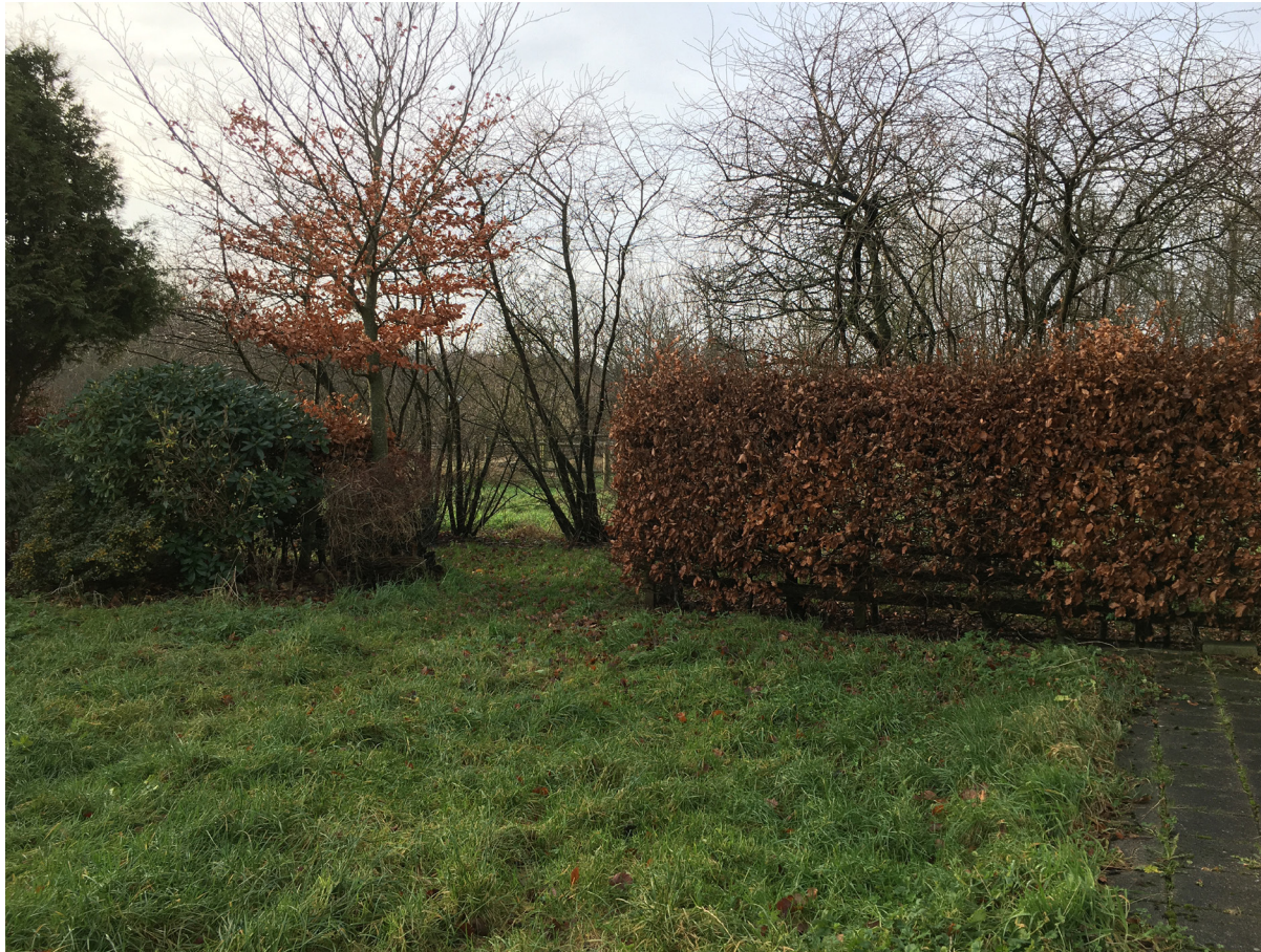
Fagus sylvatica hedgerow, fruit trees and Rhododendron varieties in the garden