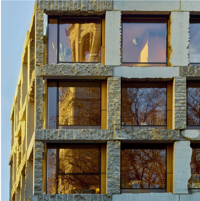
15 Clerkenwell Close