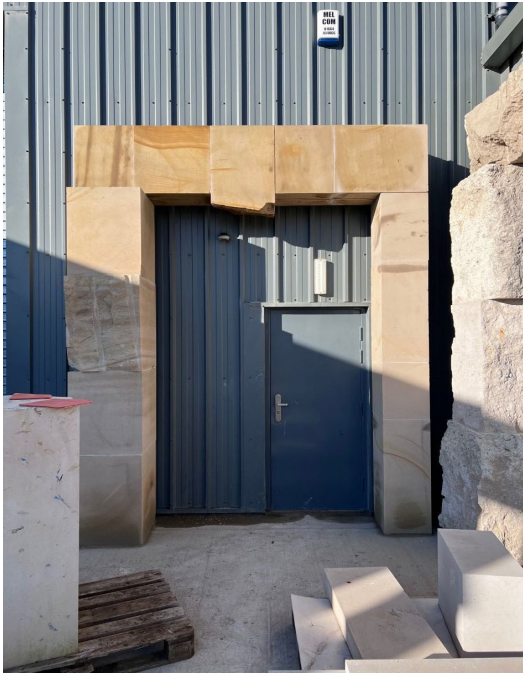
Stamford Workshop, Stone Masonry Company

Stone Masonry Company , is placed Stamford, England, where they “combine traditional stonemasonry skills and expert carving with modern design technology and innovative engineering”, in the manufacture of natural stone structures for building projects in collaboration with architects from around the world. Notably they have taken part in the design and production of a number of self supporting lime stone staircases.